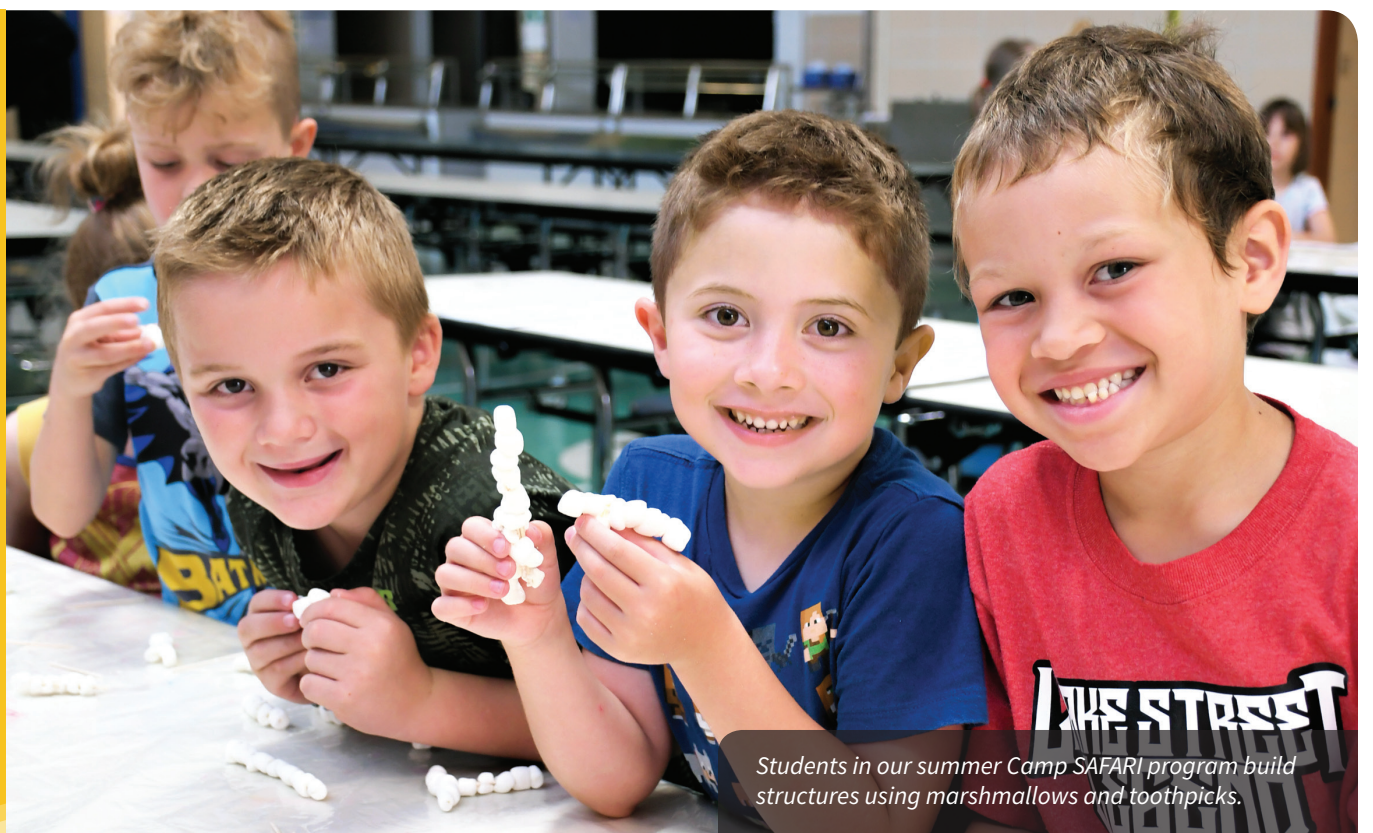
Students in our summer Camp SAFARI program build structures using marshmallows and toothpicks.

A Message from Superintendent Les Fujitake