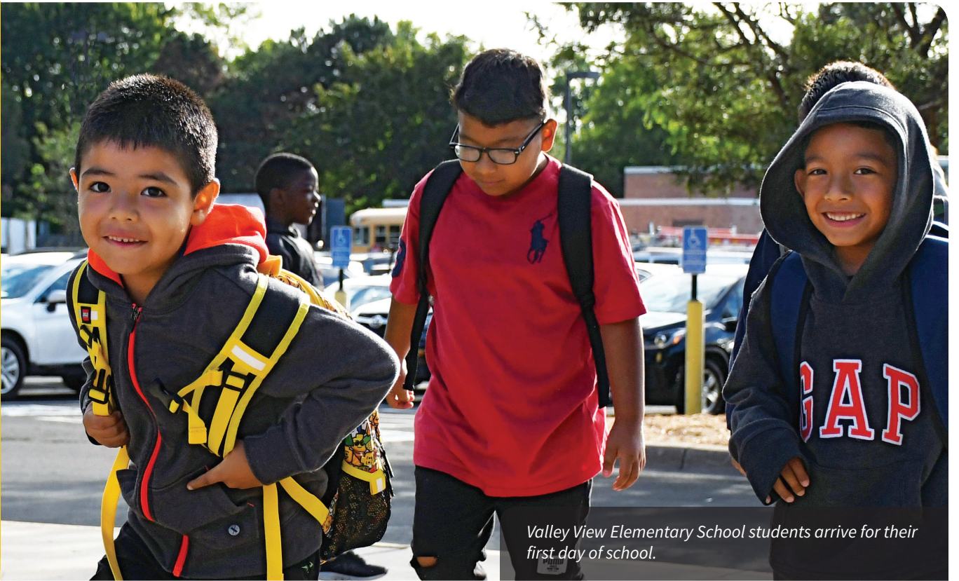
Valley View Elementary School students arrive for their first day of school.

A Message from Superintendent Les Fujitake