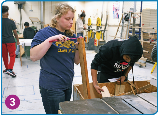
Students measure wood scraps for projects