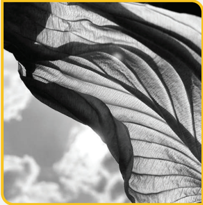
The Art in Nature